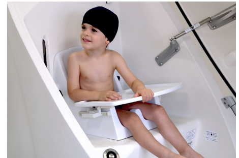
Easy body composition assessment of young children with the Pediatric Option

The BOD POD Pediatric Option allows for body composition assessment of young children between 2 and 6 years old, and as small as 12kg. It includes a customized seat insert to create a safe and comfortable testing environment, and a calibration reference volume.