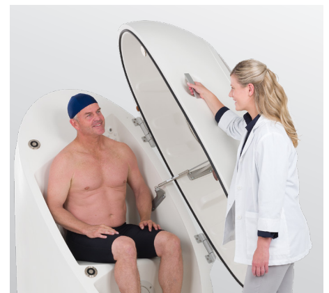
Simple and easy for both subject and operator

CONNECTED: OMNIA™ software provides database management activities, networking, communication via HL7® protocol, and integration of BOD POD test data with all COSMED systems and connected devices.